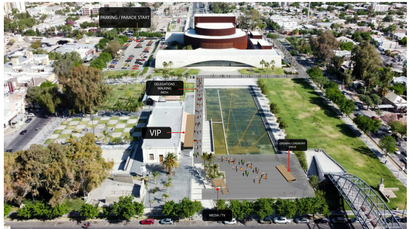
Map of the Parade & Opening Ceremony